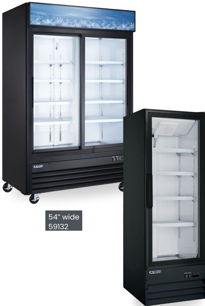
54" wide 59132

ITEM: 59132 59133 MODEL: RE-CN-0045EB-HC RE-CN-0009EB-HC